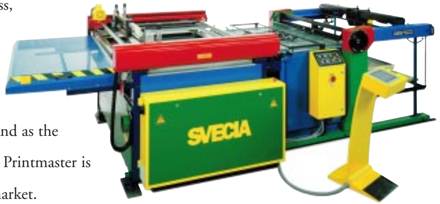
Printmaster with the optional detachable HTB feeder.

Among its extensive list of sophisticated features is the patented twin gripper bar system which ensures perfect registration and smooth, quiet operation. The Printmaster can also be fitted with a variety of systems and optional accessories which make it even more versatile, even faster and easier to operate.